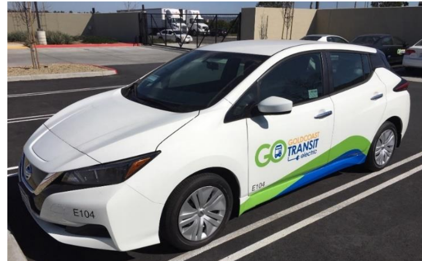
Electric Vehicle Purchased from Team Nissan, Oxnard