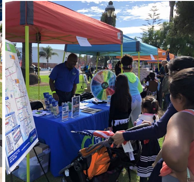
City of Oxnard Veterans Day Event, 2017