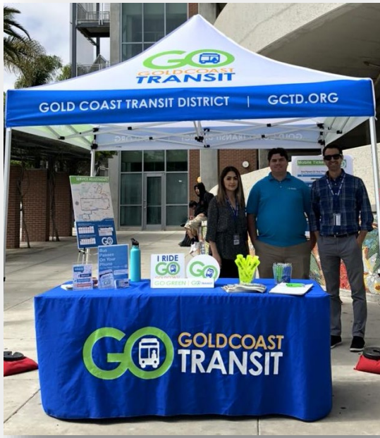
Service Change Outreach, 2018