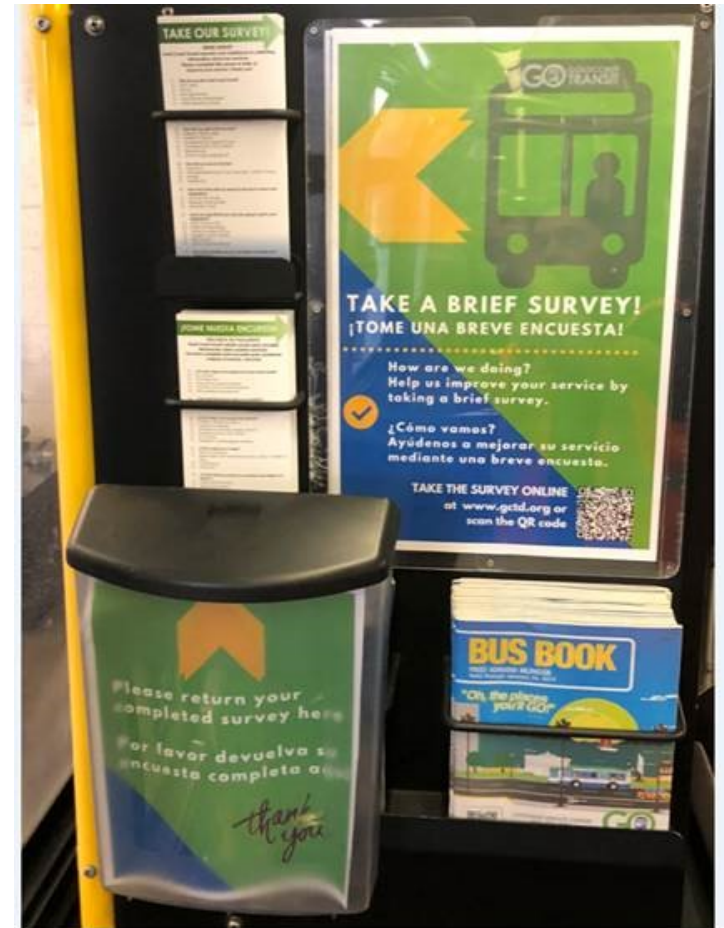
Satisfaction Survey 2019