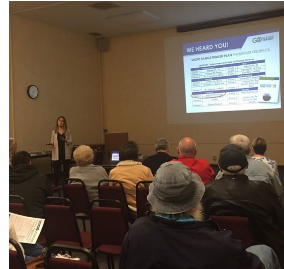
Community Meeting, 2018