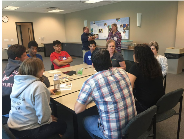
Outreach at TCRC with Rainbow Center 2017