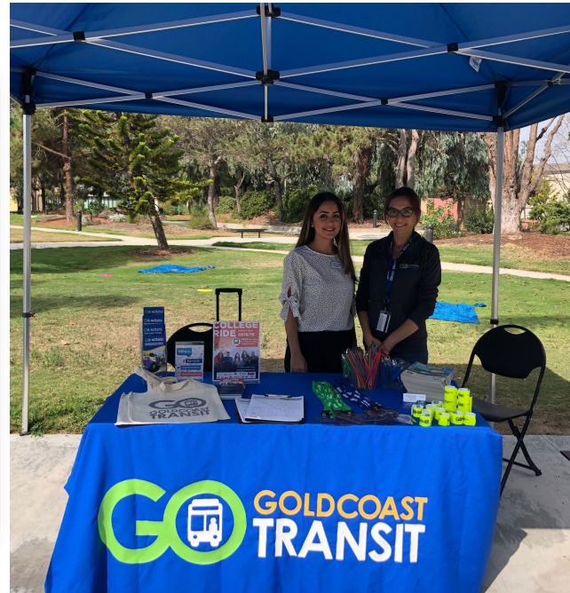
Outreach at Colleges, 2018