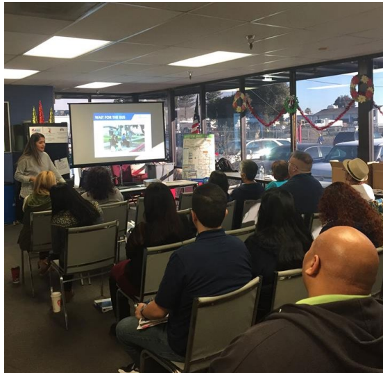
CAVC outreach 2017