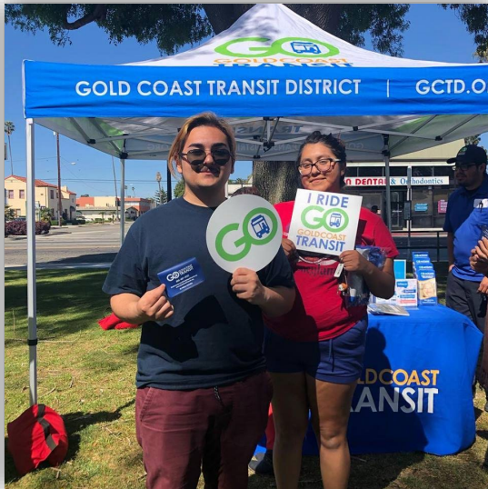
City of Oxnard Earth Day, 2019

Earth day festivals, College Resource Fair, Veterans Day