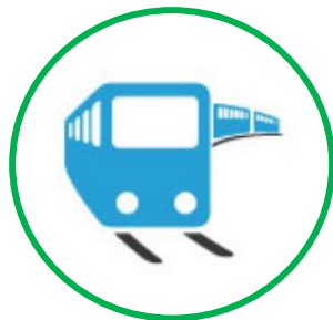
Transportation & Sustainable Communities